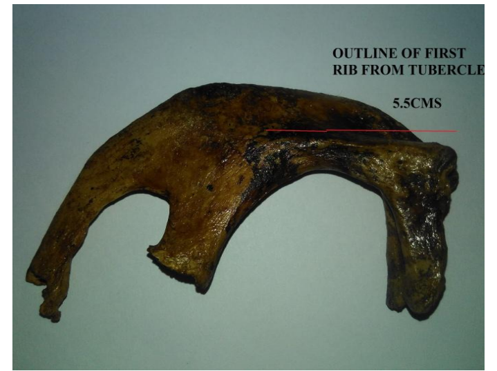
Fig -2 showing the clear outline of the outer border of first rib of about 5.5cms from its tubercle.

Costal ends of both the ribs were found to be separate. Impression of scalenus medius was present over the superior surface of the first rib and scalene tubercle was made out in the inner border of the first rib with serratus anterior tuberosity on the outer border of second rib. (fig-4).