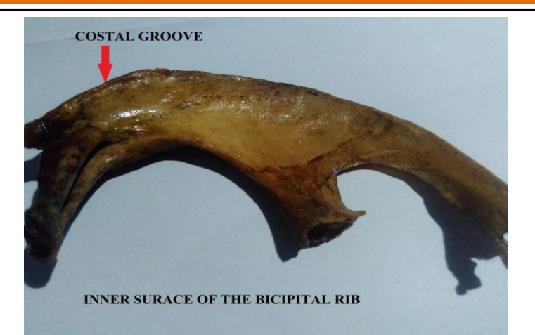
Fig -5 shows the costal groove in the posterior end of second rib in the undersurface of the bicipital rib.