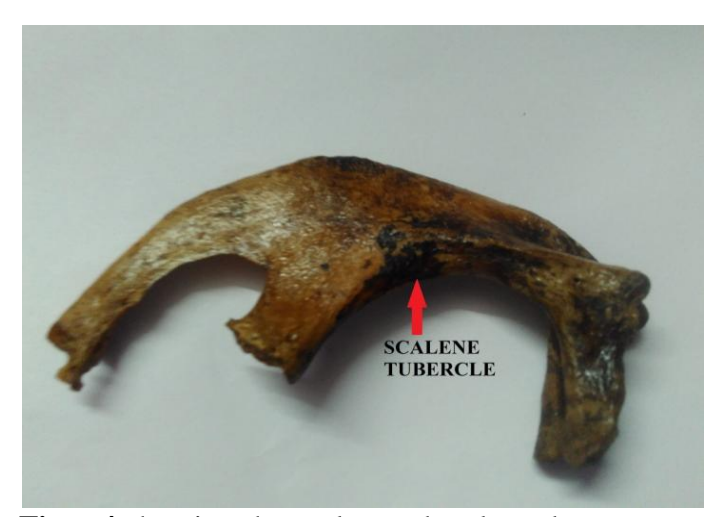
Fig - 4 showing the scalene tubercle and serratus anterior tuberosity on the outer border of second rib.

The posterior part of the inner surface of the second rib had a costal groove (fig- 5). Single rounded articular facets were seen on the heads and tubercles of the upper and lower fragments of the conjoint ribs (fig- 6).