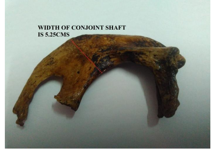
Fig - 3 showing the maximum width of conjoint shaft of about 5.25cms.

Costal ends of both the ribs were found to be separate. Impression of scalenus medius was present over the superior surface of the first rib and scalene tubercle was made out in the inner border of the first rib with serratus anterior tuberosity on the outer border of second rib. (fig-4).