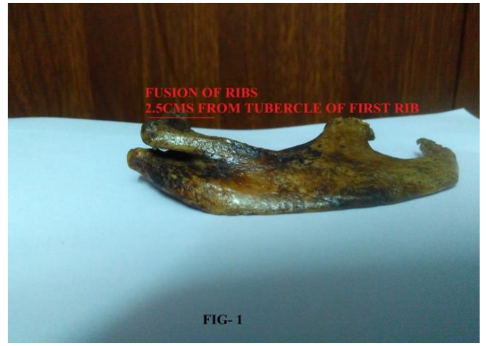
Fig -1 showing conjoint first and second ribs with the fusion occurring 2.5cms from the tubercle of the first rib.

The morphometric analysis of the specimen revealed the fusion of the first and second ribs from a point 2.5cms beyond the tubercle of the first rib (fig-1). Fusion was found to be from above downwards, as if they were overlapping. First rib outline was visible 5.5cms from the tubercle (fig- 2). Fusion of the two ribs has took place along the outer border of the shaft of the first rib and the inner border of the shaft of the second rib, so that they had formed a large plate of bone gradually spreading in width with a maximum of 5.25cms and resulting in the obliteration of three- fourth of the first intercostals space (fig- 3).