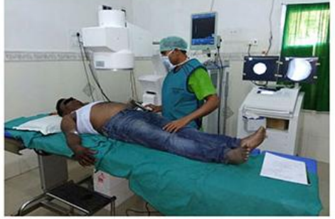
PATIENT UNDERGOING ESWL (DORNIER COMPACT DELTA 2) IN