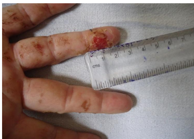
Figure 2 Volar aspect of the right fourth finger showing 2 x 1.5 cm irregular, superficial ulcer with everted edges, necrotic floor and scanty granulation tissue.