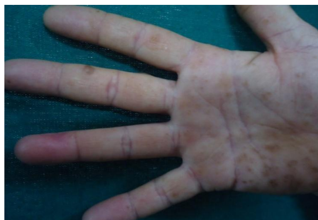
Figure 5 – Follow up at 3 months of completion of treatment showing complete healing of the malignant ulcer.