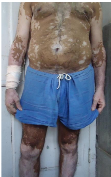
Figure 1 - Patient of generalized vitiligo with bilaterally symmetrical involvement of upper limbs, lower limbs and trunk.

Paris System rules. 45Gy to 5mm of the skin was prescribed such as 100% isodose covered the skin surface and 85% isodose to 5mm below the surface. 5Gy per fraction was delivered daily over 11 days. Following the course of brachytherapy, patient was followed up in outpatient department and topical emollients and antibiotics were prescribed. Follow up at 3 months of completion of treatment showed complete healing of malignant ulcer (fig 5). Further follow up at 1 year showed no recurrence.