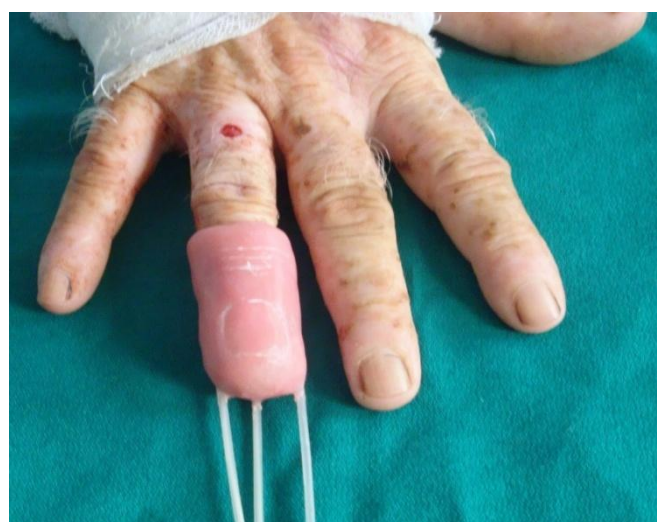
Figure 4 – Surface mould constructed over the finger for the delivery of high-dose-rate brachytherapy.