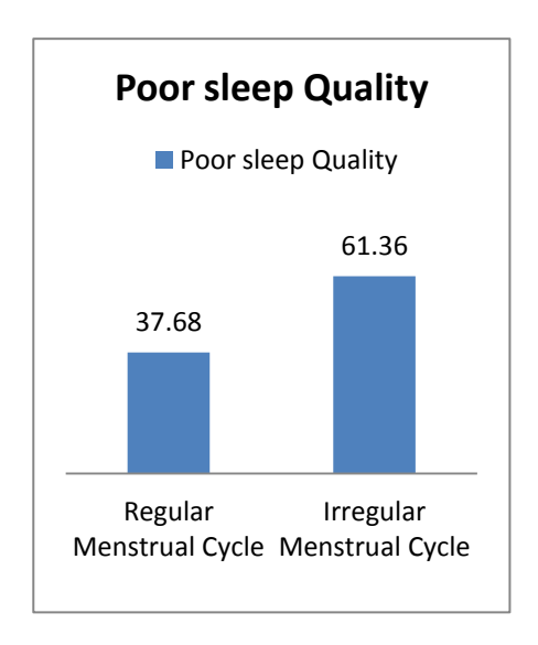
Fig.2 Relationship between poor sleep quality and menstrual cycle

Subjects with irregular menstrual cycle had 37.63% good sleep quality and 61.36% had poor sleep Quality.