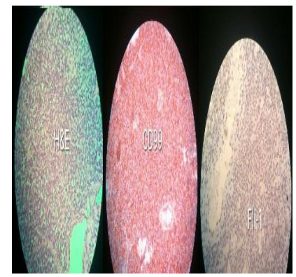
Fig 3: HPE showing malignant round cell tumor, Positive for CD99 and FLI-1.