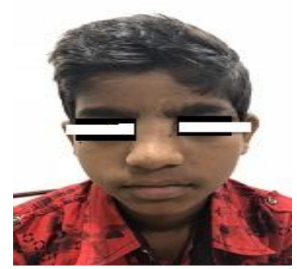
Fig 1: Patient has broadenned nasal bridge

Patient was further evaluated with Whole body PET CT scan which was s/o FDG avid large heterogenously enhancing lesion in the nasal cavity extending into nasopharynx, bilateral ethmoidal sinuses and base of skull causing expansion of nasal cavity with thinning of medial wall of bilateral maxillary sinuses and cribriform plate (SUV max:7.5)- Primary with no evidence of metastatic disease. Fig 4.