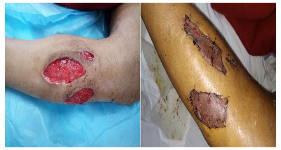
Fig.4 Crush injury forearm before & after the VAC and subsequent PTSG