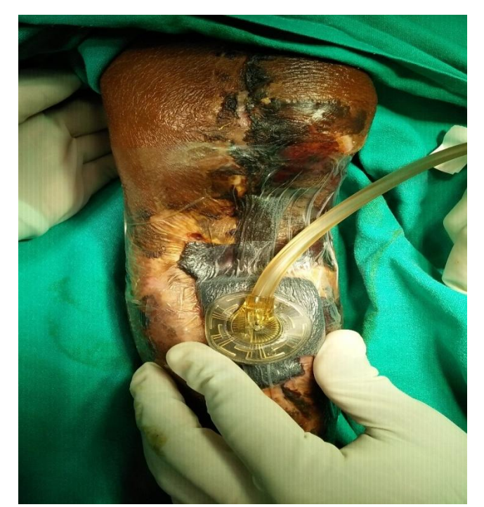
Fig.1 Patient with VAC machine applied in leg