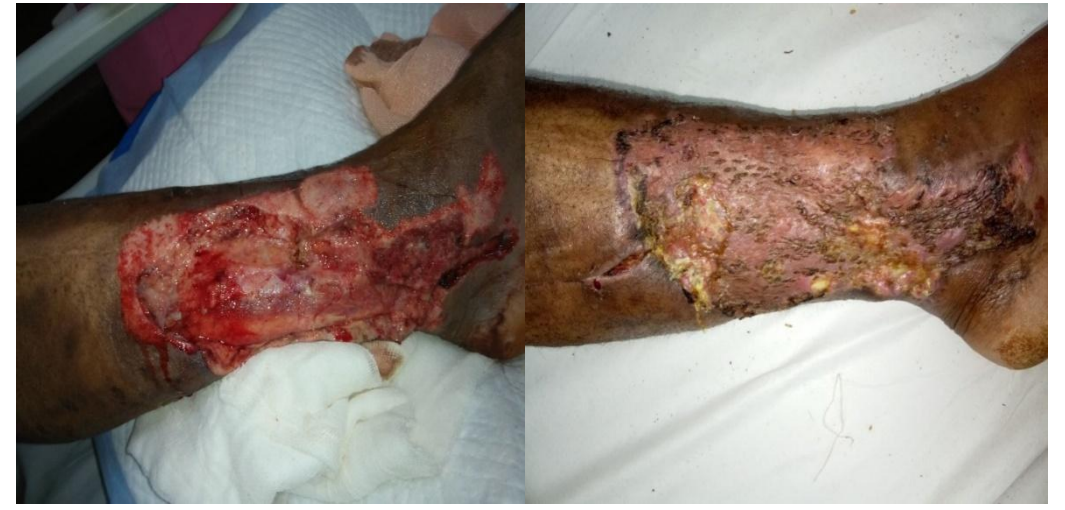
Fig.2 Before & after the application of VAC in degloving injury leg