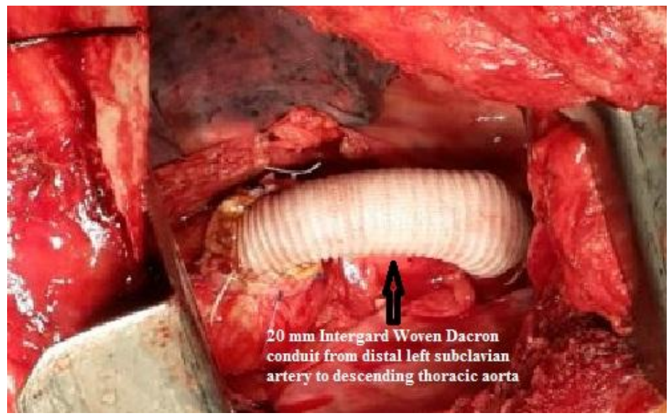
Figure 2: Extra anatomical bypass.

Vivek Rawat et al JMSCR Volume 06 Issue 02 February 2018