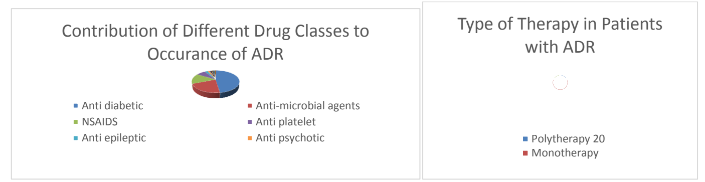
Fig 2 : Class of Suspected Drugs causing ADR and Type of Therapy in Patients with ADR Anti-diabetic drugs were the most common class of drugs causing ADR followed by antimicrobial agents. Polytherapy (two or more drugs) was

most common suspected drugs causing ADR were Insulin and sulfonylureas.