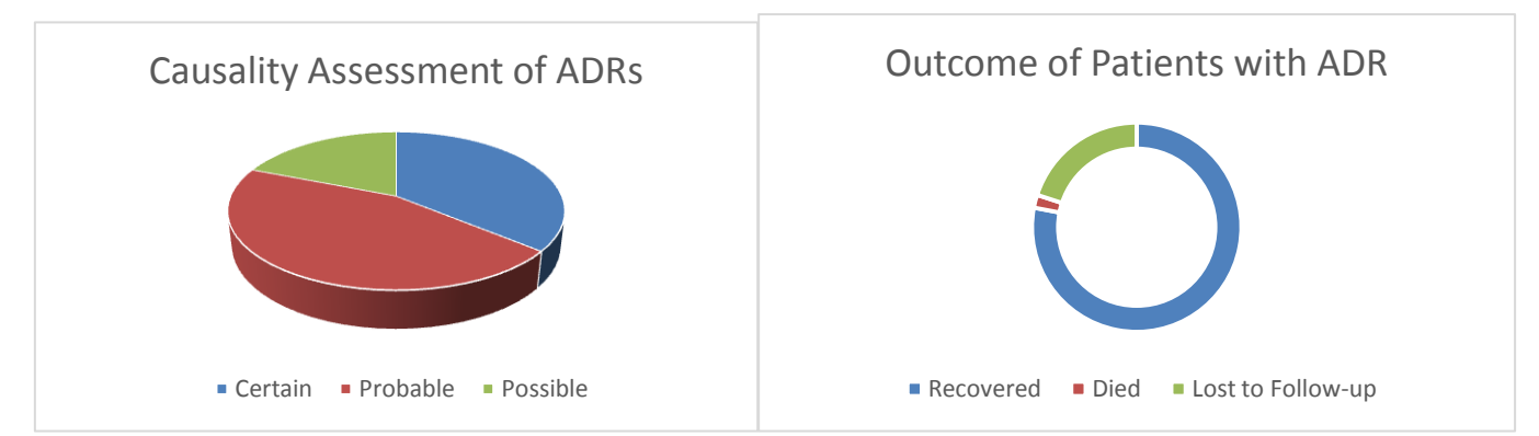
Fig 3: Causality assessment of ADRs (using WHO-UMC Assessment Scale) and Outcome of Patients with ADRs.

found in 60.4% cases, monotherapy (one drug) and FDC (fixed dose combinations) in 19.8% cases in each category.