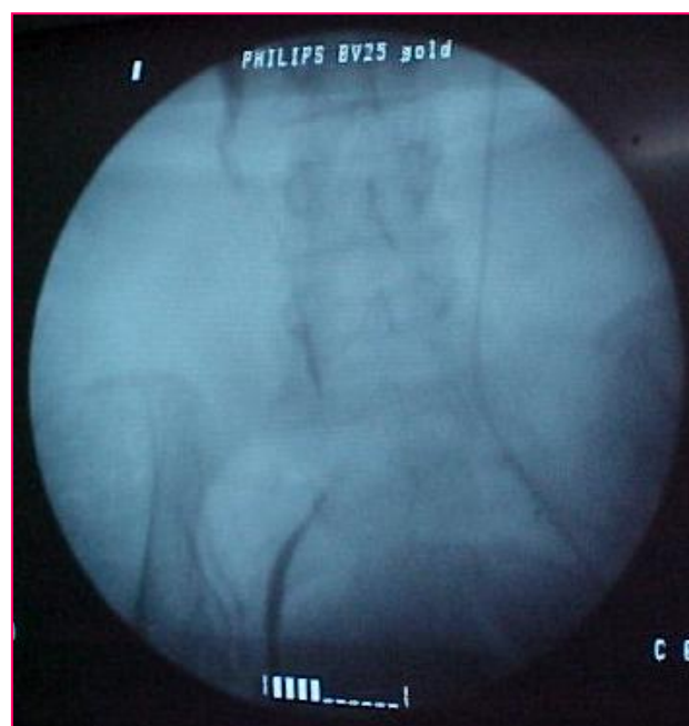
Fig 1 Retrograde pyelography typically demonstrates hydronephrosis, with medially deviated and segmentally narrowed ureters without filling defects

Eleven patients underwent surgical exploration and specimen sent for histopathological examination. Only DJ stenting in 2 patients. one had PCN. out of 14 patients, 2 died. One patient died with hyperkalemia preoperatively, one after completion of chemotherapy, one patient on b/l dj stents got symptomatic relief with ATT. Post operatively treated with steroids for 1 year.