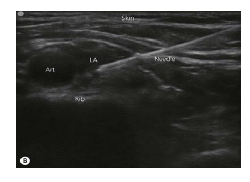
Fig showing nerve bundle,position of needle, and spread of drug.<sup>5</sup>

version 10. Data are expressed in its frequency and percentage as well as mean and standard deviation. For all statistical evaluation, a two tailed probability of value, < 0.05 was considered