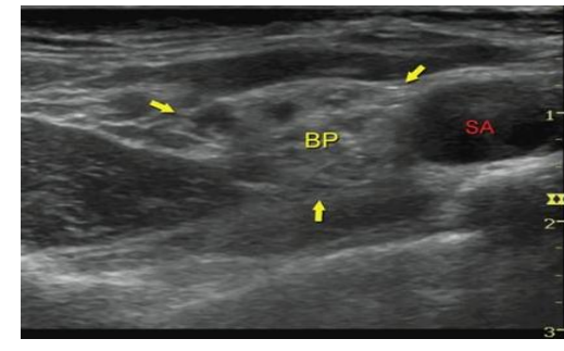
Fig showing structures surrounding brachial plexus in supraclavicular approach<sup>4</sup>

Motor power of block was assessed by asking patient to flex the forearm and hand against gravity and to abduct the shoulder Data were analysed using computer software, statiscal package for social sciences (SPSS)