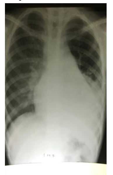
Fig 1: chest X-ray showing cardiomegaly non homogenous patch left side