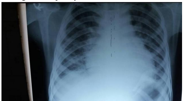
Fig 3 showing cardiomegaly and opacity on right lung