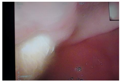
Figure 2- Endoscopic view of the mop fistulating into stomach