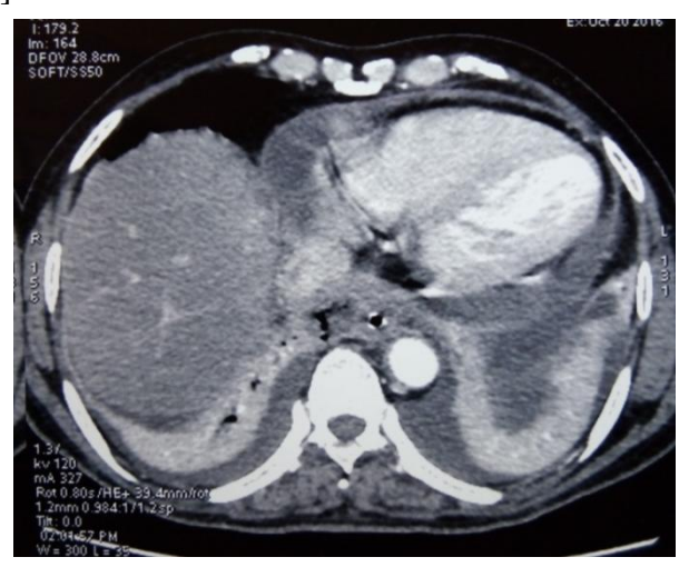
Fig 2 – image showing esophageal perforation with right peri-esophageal collection with air foci with bilateral pleural and pericardial effusion

Patient and attendants given option for fully covered endoscopic self expandable metallic stent (FC-SEMS) placement, but patient and attendants refused due to financial constraints. Ryles tube (18 Fr) was placed over guidewire under endoscopic guidance. On reviewing history, patient and attendants, gave history of meat and alcohol ingestion, one week prior in a marriage ceremony. Possibility of large meat bolus ingestion under influence of alcohol, and alcohol induced amnesia leading to forgetfulness about the event. Contrast Enhanced CT - chest done which revealed esophageal perforation on right lateral wall above gastroesophageal junction with right peri-esophageal collection with air foci with bilateral pleural and mild pericardial effusion [Fig 2].