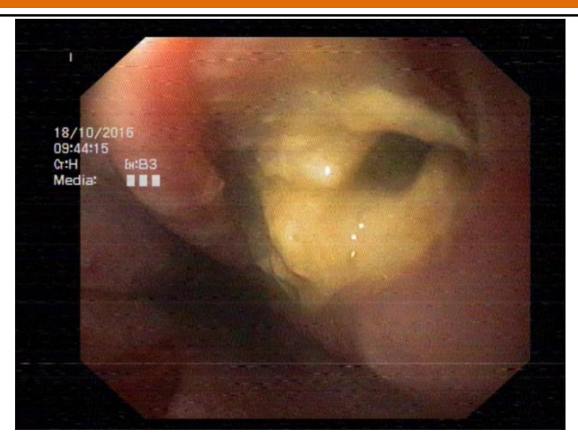
Fig 1b – image showing esophageal perforation after bone removal

Patient and attendants given option for fully covered endoscopic self expandable metallic stent (FC-SEMS) placement, but patient and attendants refused due to financial constraints. Ryles tube (18 Fr) was placed over guidewire under endoscopic guidance. On reviewing history, patient and attendants, gave history of meat and alcohol ingestion, one week prior in a marriage ceremony. Possibility of large meat bolus ingestion under influence of alcohol, and alcohol induced amnesia leading to forgetfulness about the event. Contrast Enhanced CT - chest done which revealed esophageal perforation on right lateral wall above gastroesophageal junction with right peri-esophageal collection with air foci with bilateral pleural and mild pericardial effusion [Fig 2].