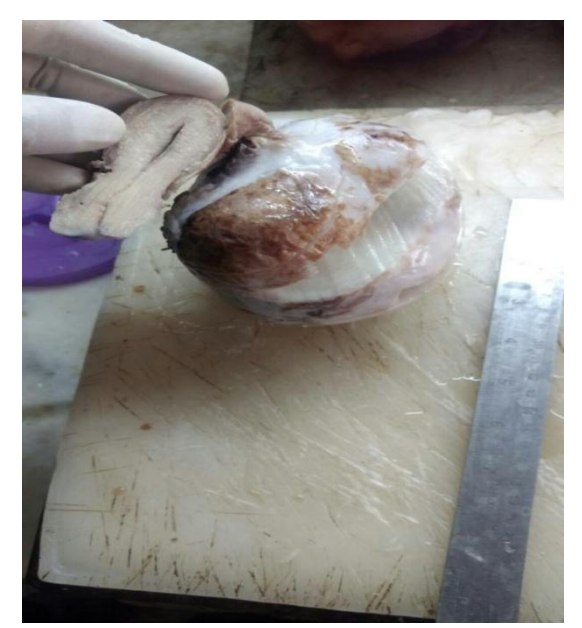
Fig. 1.Gross appearance of ovarian fibroma

oedema, occasionally with cyst formation, are also relatively common.