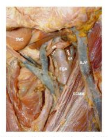
Figure 1. In the left side of the neck, the linguofacial trunk (LFT) arises from anterior surface of the external carotid artery (ECA) and the ascending pharyngeal artery (APA) originated from the occipital artery (OA). SMG; Submandibular gland, SCMM; Sternocleidomastoid muscle, EJV; External jugular vein, HN; Hypoglossal nerve.

The other branches for the face like Superior labial, lateral nasal and angular arteries arises from the Transverse facial artery (Fig: 2 and 3). Also we noticed that, the ascending pharyngeal artery originated from the occipital artery, but it is usually arises from the External carotid artery as medial branch (Fig:1).