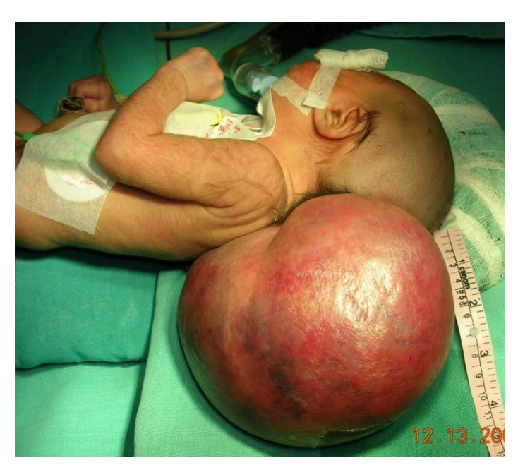
Figure 1. Clinical photograph showing giant occipital encephalocele

The patient was operated in left lateral position under GA. After careful part preparation and draping, the sac was dissected out and the dysplastic brain tissue was excised. The sac was closed in single layer using continuous suture, skin and subcutaneous tissue was closed. The post- operative period was uneventful and baby was discharge without neurological deficits.