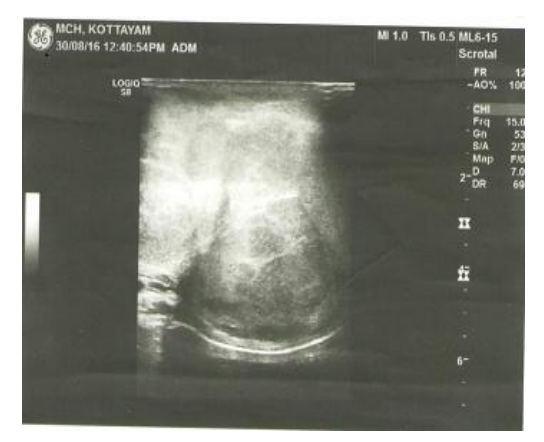
Figure 1 . USG Scrotam showing Michelis Heterogenous echogenic lesion in left testis

lasmic Michaelis-Gutmann bodies (Figure 2). The diagnosis of malakoplakia of testis was confirmed.