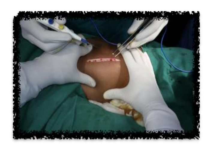
Fig.3 Image showing the dissection of tumor