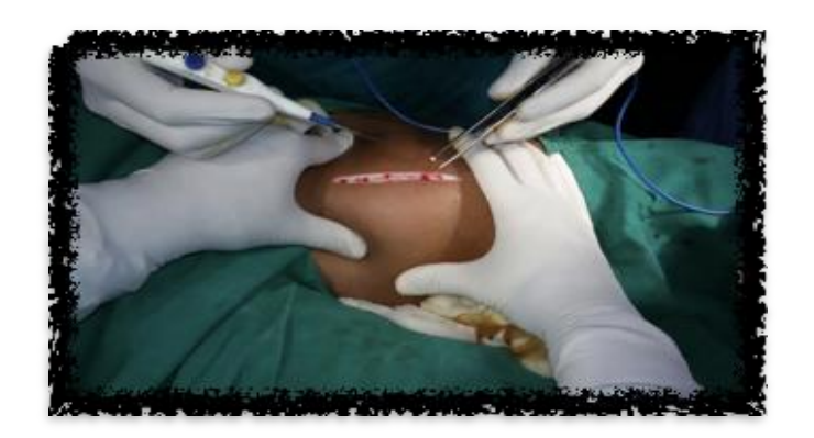
Fig.2 Linear incision being taken over the tumor