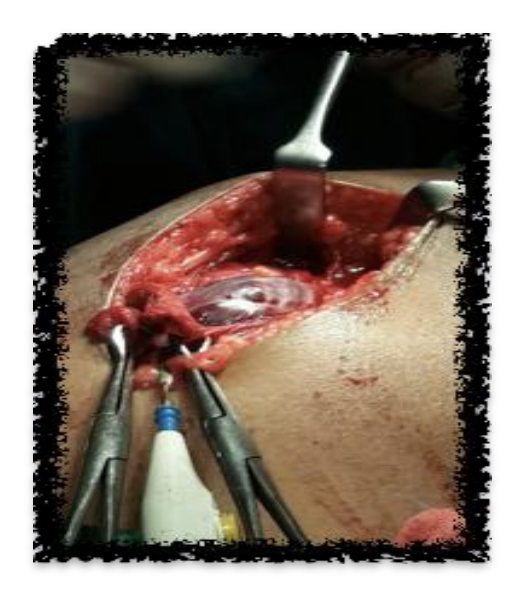
Fig.4 & 5 Showing the surface of tumor arising from the nerve sheath