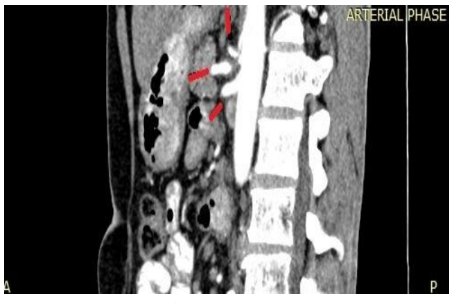
Fig 2 LH –Ao.

In this case the CHA arising from the coeliac axis is seen coursing through its normal preportal course before giving off the GA and LH. The RH after taking origin from SM artery is seen taking a suprapancreatic retroportal course.