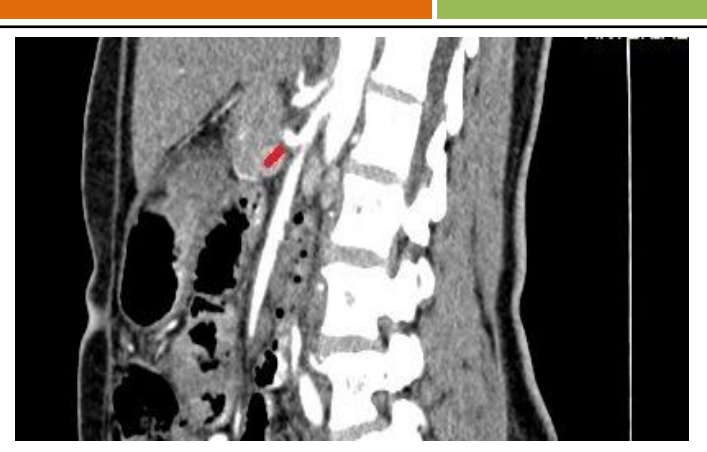
Fig 3 - RH –SM The RH is seen taking origin from SM.