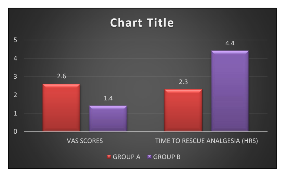
Swetha Purohit et al JMSCR Volume 05 Issue 12 December 2017