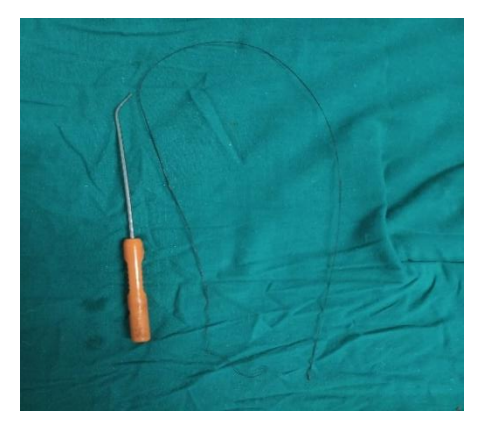
Fig 3.Banana Laso with nitinol wire