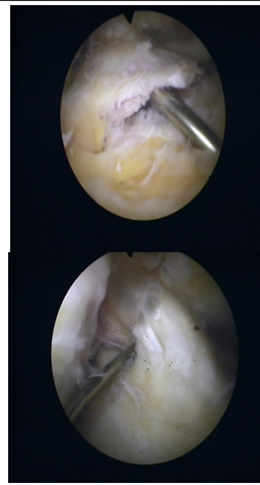
Fig 2. Intraoperative arthroscopic views of the right knee viewed from the anterolateral portal.(A) Tibial spine fragment is probed to determine the amount of displacement, comminution, and soft tissue involvement. (B) A probe is used to ensure tension in the anterior cruciate ligament (star)

To ensure that the femoral attachment of ACL being intact it is probed and the tibial spine avulsion is identified and inspected. Tibial spine fragment is probed to determine the amount of displacement, comminution, and soft tissue involvement. Often the avulsed fragment is larger than that suggested by the radiograph due to the cartilaginous component. The medial meniscus, lateral meniscus, and inter meniscal ligament are examined and probed to determine their relationship to the fracture fragments. The ACL should be looked for ecchymosis and attenuation. A 3.5-mm motorized shaver is used to debride haematoma and loose fragments from the fracture base. Sometimes the medial meniscus or inter meniscal ligament is incarcerated in the fracture and it is released with a probe.