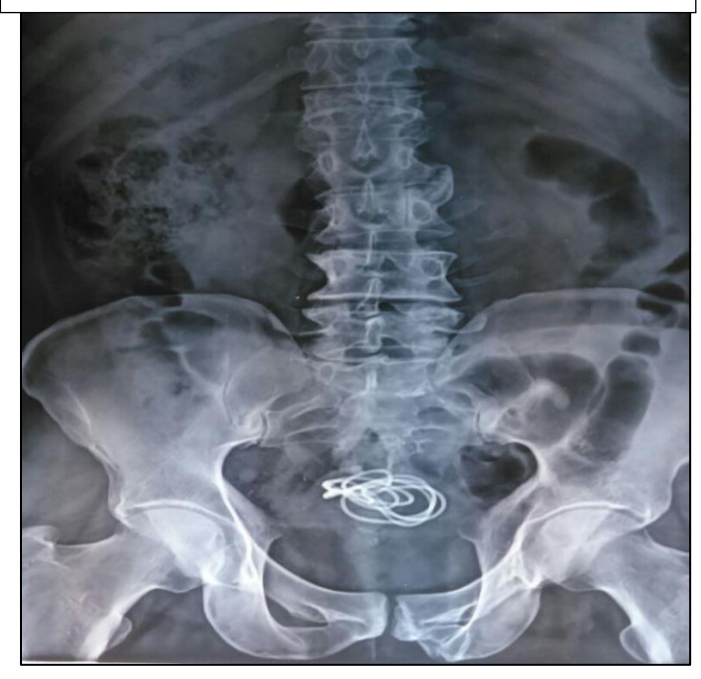
Fig.01 X-ray KUB showing coiled DJ stent in bladder

Hence, patient underwent cystoscopy under spinal anesthesia and the coiled DJ stents were removed in toto.On examination, the stents had encrustations.