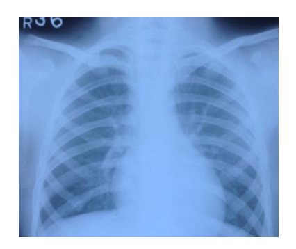
Regeneration of clavicle after 1 year