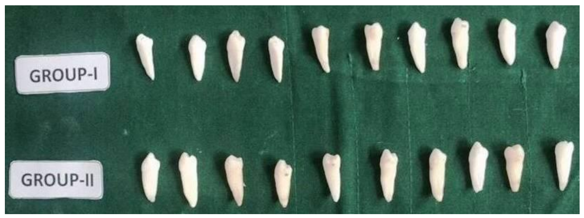
Fig 01 teeth divided into 2 groups