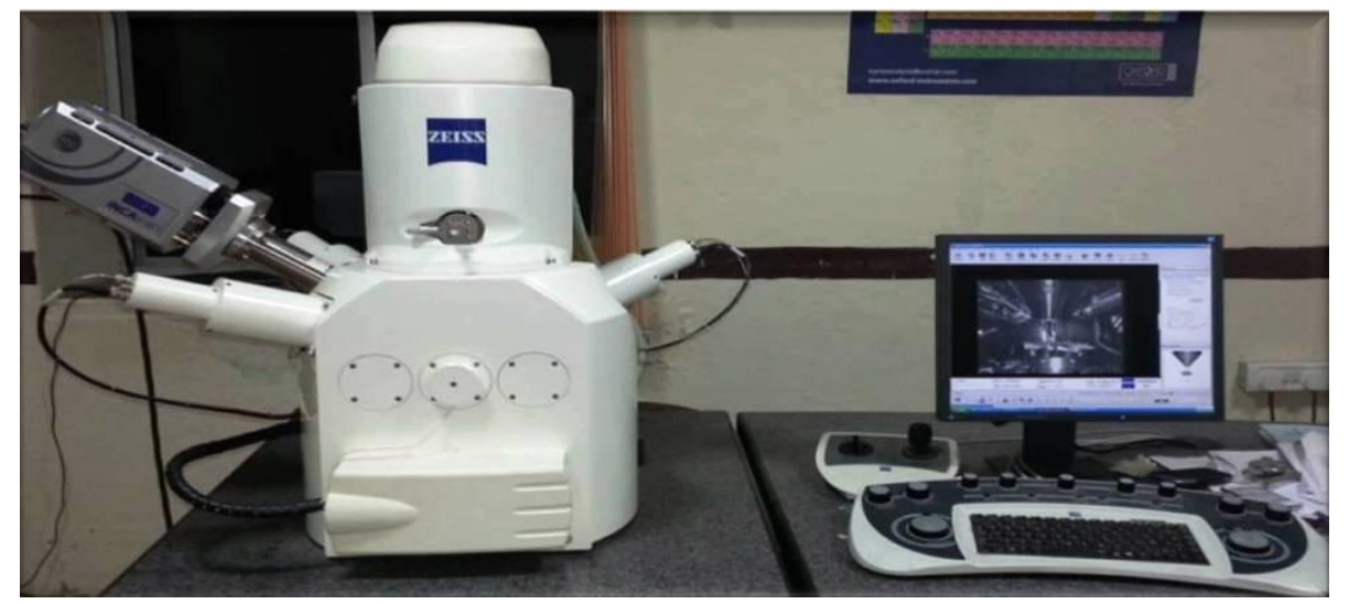
Fig 02 Scanning Electron Microscope