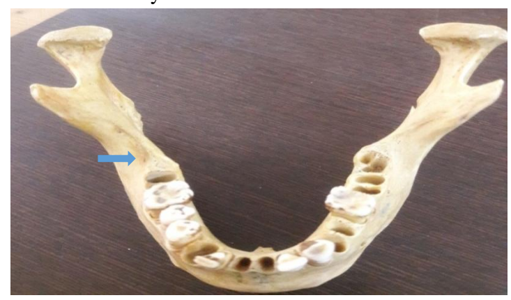
Fig 1: Retromolar Foramen (Right side)

Sciences, Dehradun for the presence of retromolar foramen. The mandibles were observed for the presence of retromolar foramen (RMF) bilaterally (figure no. 3), on the right side (Figureno.1) and left side (Figure no.2) and to look into the prevalence of RMF on the retromolar triangle in the cadaveric dry human mandibles.