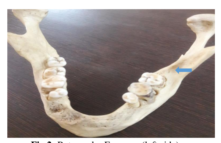
Fig 2: Retromolar Foramen (left side)