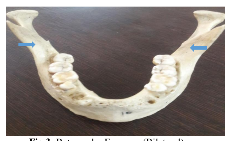
Fig 3: Retromolar Foramen (Bilateral)