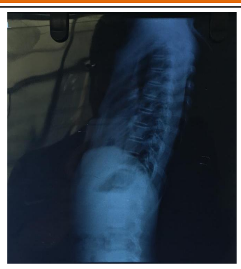
Chest X-ray PA view and Lateral view.