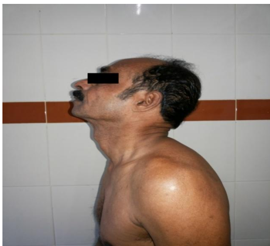
Figure 1: Patient having dystonic posturing of neck, predominantly laterocollis and retrocollis

On examination patient was fully conscious well oriented, appeared anxious and fearful. Bilateral immature cataract were present. There were painful spasms of hand on inflating sphygmomanometer cuff above systolic blood pressure (i.e. Trousseau's sign was positive). Patient had persecutory delusions but there were no hallucinations. His memory and speech were normal. All the cranial nerves were intact. Motor power was normal in all four limbs and sensations were intact. Deep tendon reflexes were brisk with bilateral flexor plantar.