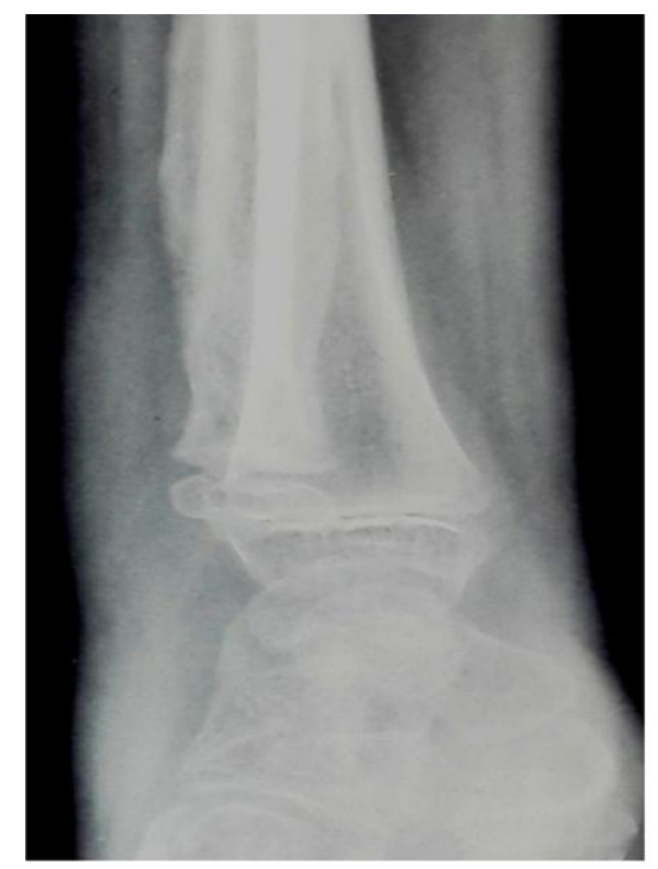
Figure 2: Xray Ankle Joint Showing Periosteal Reactions