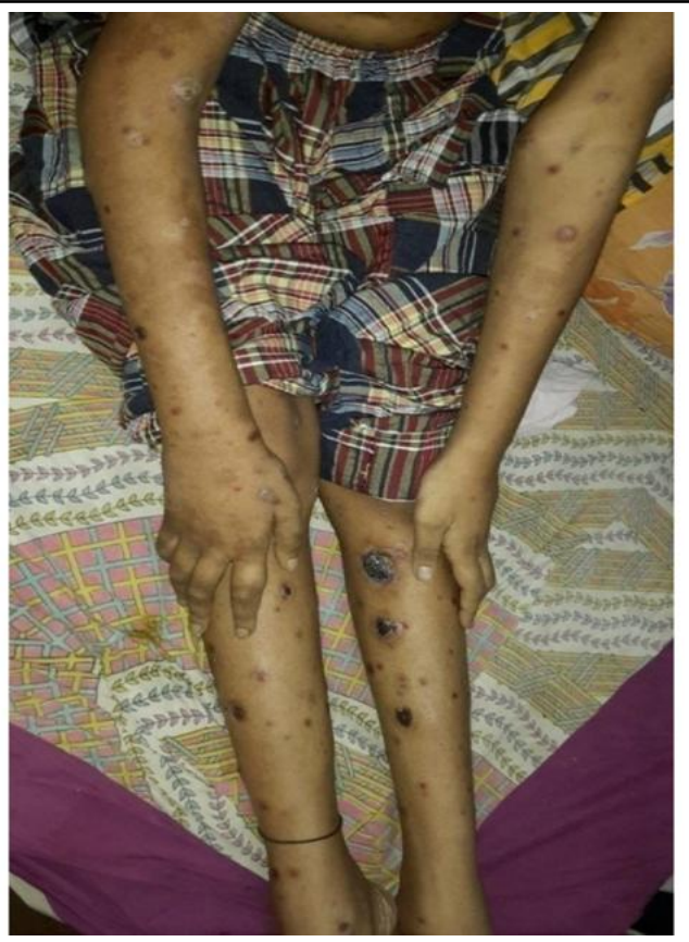
Figure 1: Papulonodular Skin Leisons

Physical examination revealed discrete, firm, reddish-brown, nontender papules and nodules ranging from 2 mm to 2 cm over the elbows, trunk, thigh, ears, both upper limbs (Fig.1); and arthritis of wrists, metacarpophalangeal, proximal and distal interphalangeal joints, knees, ankles and elbows,. The child was febrile with bilateral cervical lymphadenopathy and enlarged liver. Vitals and other systemic examination were within normal limit. Initial investigation showed high total count (33600), with neutrophilic preponderance, hemoglobin 11.1, peripheral blood smear showed no abnormal cell, CRP was 136 mg/dl, ESR 112. CXR, LFT, RFT, viral serology, Mantoux, Blood C/S all were normal. USG abdomen showed hepatomegaly. Xray wrist and ankle joint showed periosteal reaction(figure 2). Bone marrow study was normal, lymphnode biopsy showed reactive hyperplasia. On skin biopsy dermis showed patchy interstitial and perivascular polymorphic cell infiltrate with abundance of histiocytic cells and macrophages compatible with a histiocytic disorder(figure 3). The skin tissue screened for CD 1a, S-100 proteins and CD20, CD3 were negative. So our patient had histiocytosis which by immunohistochemistry was negative for Langerhans cell histiocytosis and lymphoma. On the basis of clinical presentation, radiology and histology the child was diagnosed to be suffering from multicentric reticulohistiocytosis (MRH).