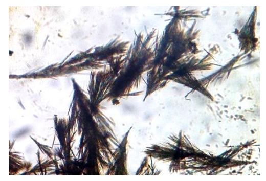
Figure 1. Needle shaped crystals (Glucose)

+ = appearance of crystal, ++ = intense appearance of crystal, - = no appearance of crystal.