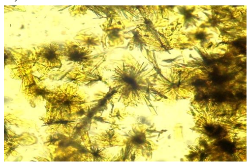
Figure 7. Sun flower shaped crystals (Maltose)