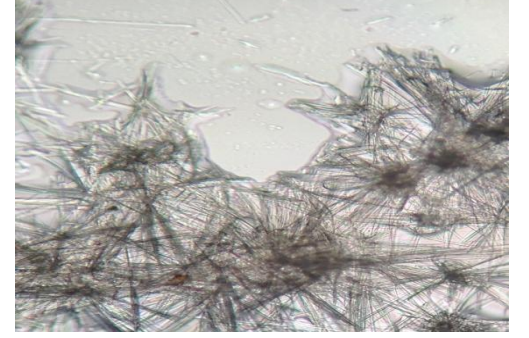
Figure 4. Balls with thorny edge shaped crystals (Galactose)