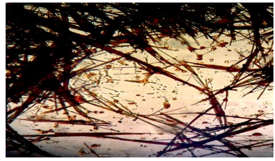
Figure 6. Fine-long needle shaped crystals (Xylose)