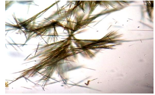
Figure 2. Needle shaped crystals (Fructose)