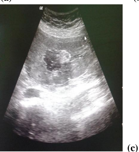
Figure 1: (a) Abnormal umbilical artery wave form with absent diastolic flow. (b) Abnormal low resistive MCA waveform (brain sparing effect). c) Placenta grade III.

Patient (2): Patient diagnosed as late onset preeclampsia. The initial ultrasound examination done at 35 weeks showed IUGR, borderline liquor volume, placenta grade II and abnormal high restive umbilical artery Doppler indices (RI=0.72), however the middle cerebral artery Doppler and aorta Doppler were of normal