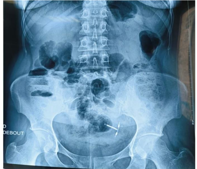
Figure 1: The ASP in standing position

The diagnosis of secondary perforation of the uterus and partial migration of the IUD was retained and the patient underwent a laparoscopy for removal of the migrating IUD. The exploration allowed visualization of the arms of the IUD through the sigmoid colon with an omental inflammatory reaction. After discussion with the visceral surgeon, a mini-laparotomy of the Pfannenstiel type was decided, thus allowing visualization of the IUD whose vertical branch was implanted in the intestinal lumen. (Figure 2). The IUD was removed and then the sigmoid defect was closed with several interrupted stitches and a running suture. The postoperative course was unremarkable.